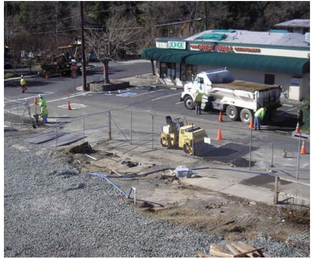
View from Second Level (looking southwest from the West Reading Deck)