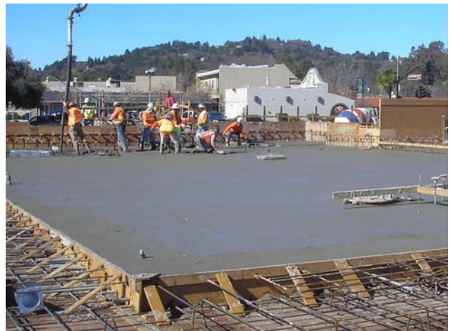
Concrete spreading on Second Level