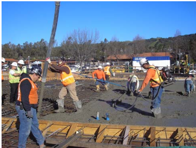
Concrete pouring and spreading on Second Level