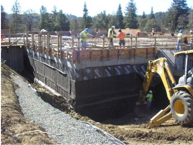
Backfilling around the foundation