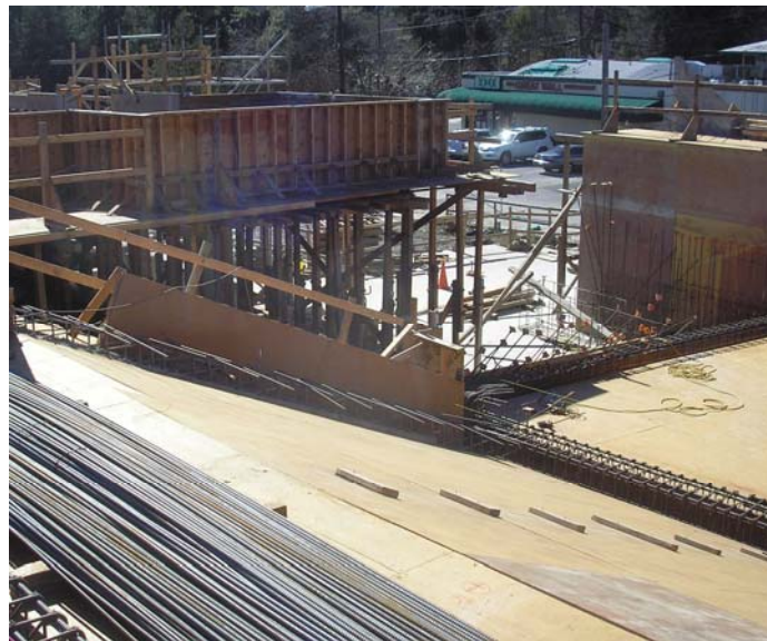
Looking down the Plaza Staircase into the Reading Court below