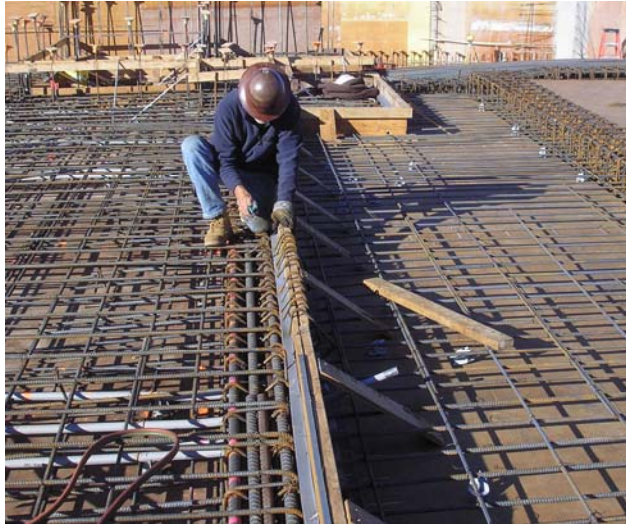
Installing rebar on Second Level

Construction Activities: Work was focused in two areas – backfilling around the foundation and preparing Second Level deck for concrete pouring. Away from the construction site, the roof and timber system is now in fabrication.