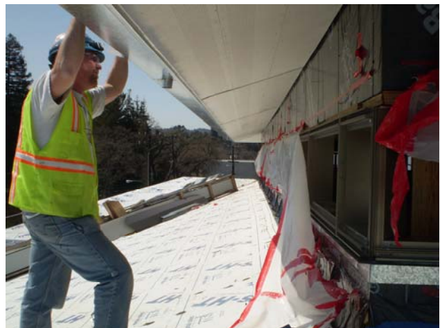
Installing clerestory window over the main Library space