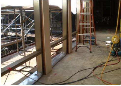
Finished window frames