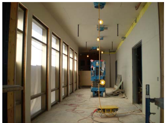
Community Hall Gallery