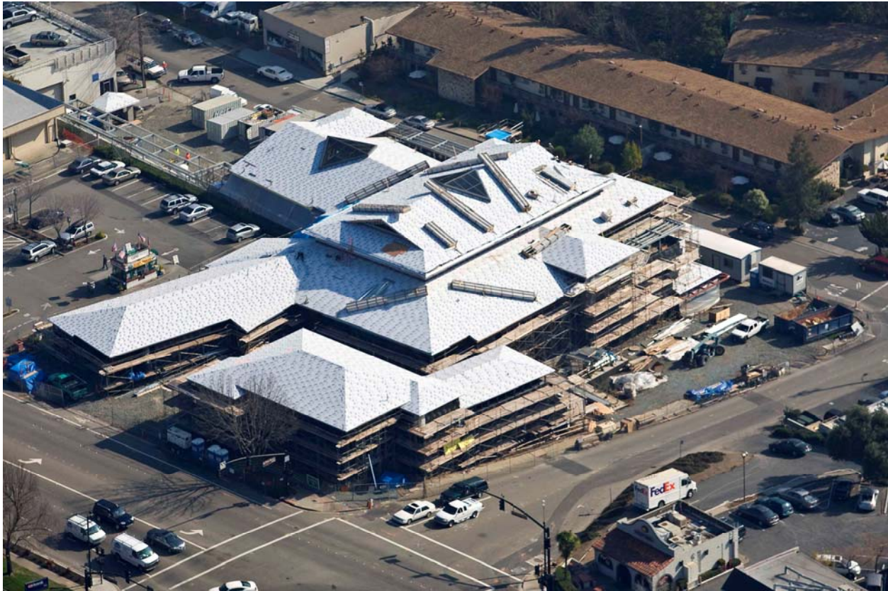
Aerial photograph – February 2009

Construction Activities: The major exterior work continued to be the roof and the windows. Rain slowed the installation of the roof panels, but good weather has allowed progress to be made. The installation of windows is underway. Work on the interior includes sheetrock and finer details on the various systems – electrical, fire safety, HVAC, and plumbing.