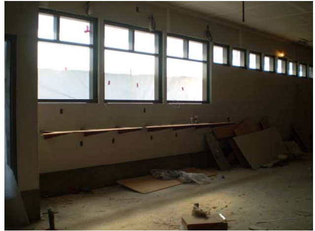
Windows on Staff Work Space east wall