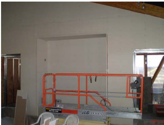
Media screen space in the Lobby