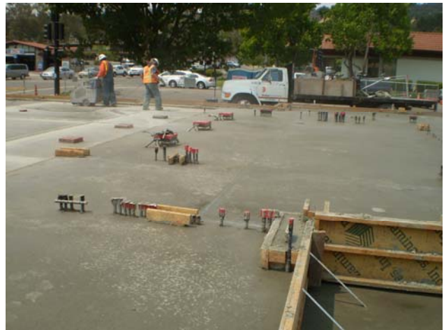
Finishing the Community Hall sub-floor