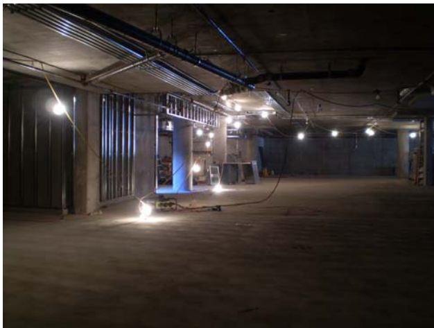
Utility work in the Parking Garage at the Basement level