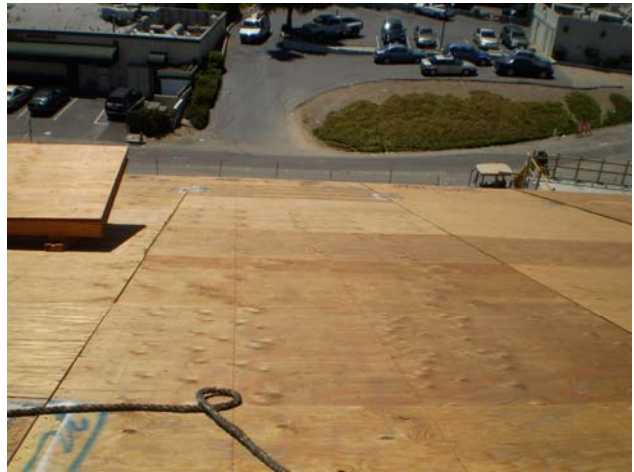
View of First Street from the roof