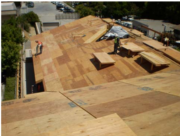
View from roof of main Library to the roof of the Children's Area