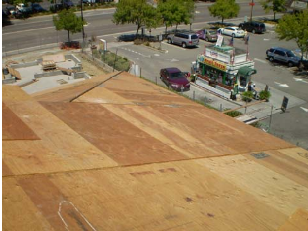
View from the roof looking northeast towards Mount Diablo Blvd.

Construction Activities: Work on the roof continued with the installation of the outer sheets. The sub-floor of the Community Hall was completed. On the interior, work continued on space walls and utilities.