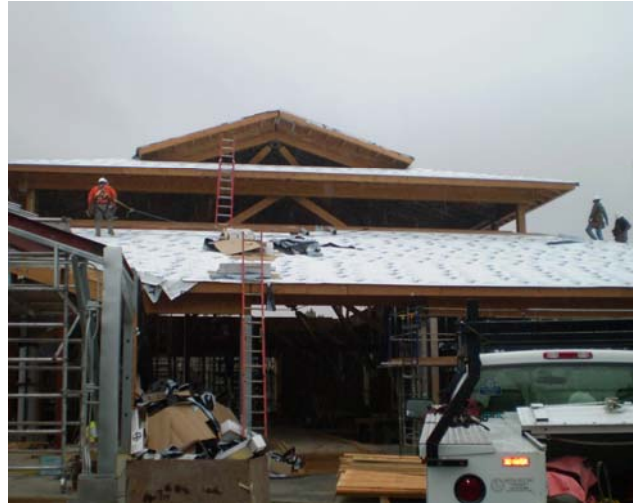
Installing the roof under-layer at the Main Entrance