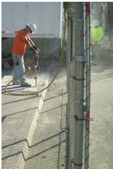
EBMUD work on Golden Gate Way