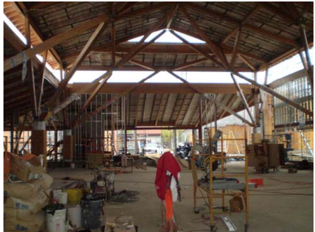
Looking north through the Adult Area towards the Entrance with the clerestory window and skylight above