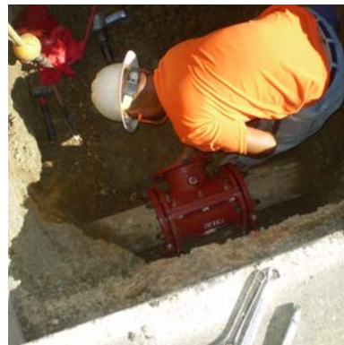
EBMUD work on First Street