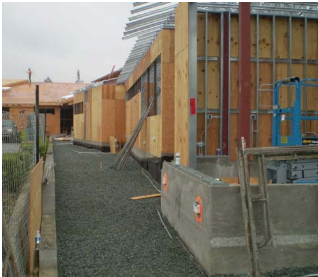
Looking south along the eastern property line with the Staff Wing to the right and Children's Area in the background