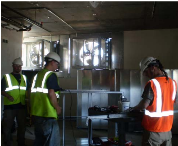
Installation of mechanical equipment in Parking Garage