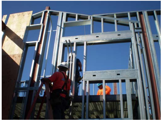
Framing of Community Hall wall