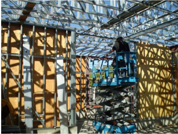
Framing of walls and roof in the Staff Wing

Construction Activities: On the interior, work continued on framing walls and installing utility connections. Framing for the clerestory windows around the main Library space continued. The roof structure over the Staff Wing was constructed. On the exterior, with the first rain of the season, the focus has been to secure the structure for winter. EBMUD installed the water connections on First Street and Golden Gate Way.