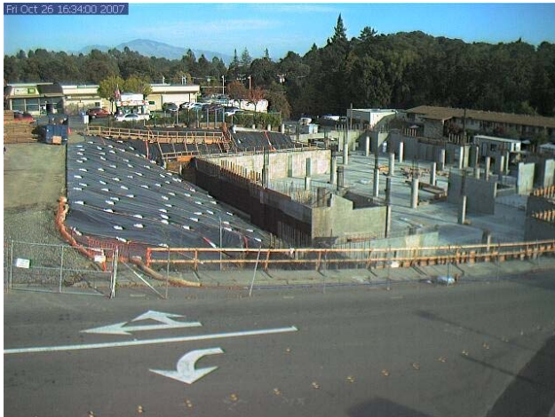
October 26, 2007