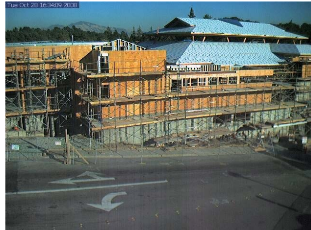
October 28, 2008

Public Art: The first phase of the two public artworks installations is about to begin. The connections for Brian Goggin's flying pages will be inserted into the exterior walls prior to weatherproofing the walls. The wall of the Children's Activity Deck will be drilled out for Kana Tanaka's "portholes" prior to weatherproofing.