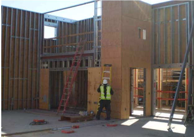
Framing of wall around the Community Hall platform and platform storage space

Construction Activities: Work continues on the walls in the Library and Community Hall buildings. The roof trusses for the Community Hall are in place. Mechanical and safety systems are being installed. PG&E connected its service from Golden Gate Way. However, the primary focus has been and will continue be getting the buildings and site ready for the winter rains.