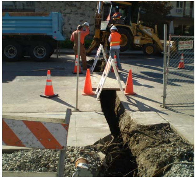
Installation of PG&E service connection