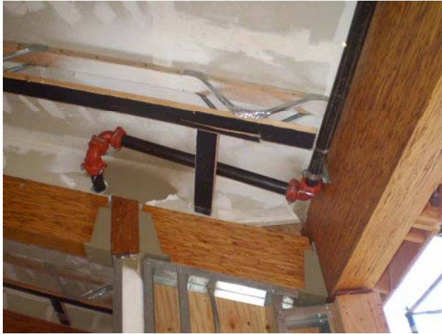
Ceiling fire sprinkler connections