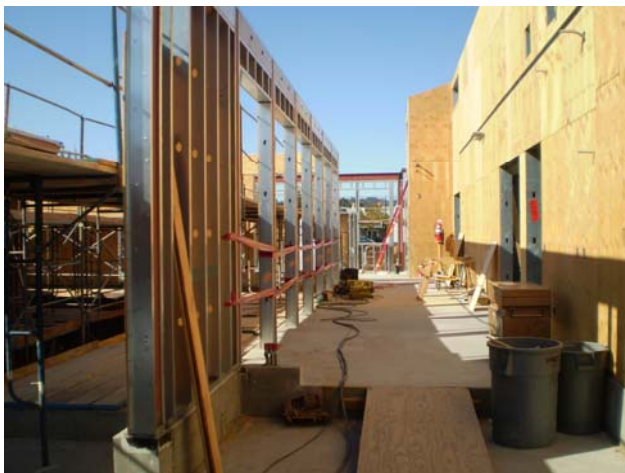
Looking west through the Lobby & Community Art Gallery of the Community Hall