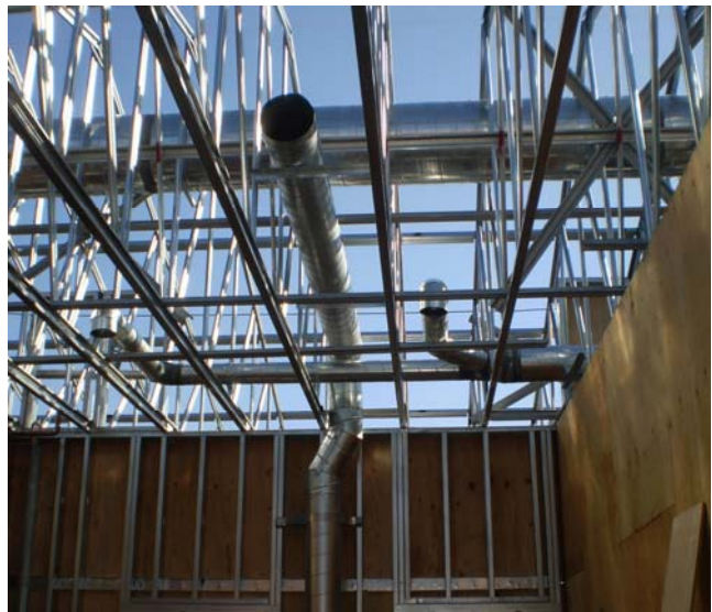
Duct work in the Staff Wing