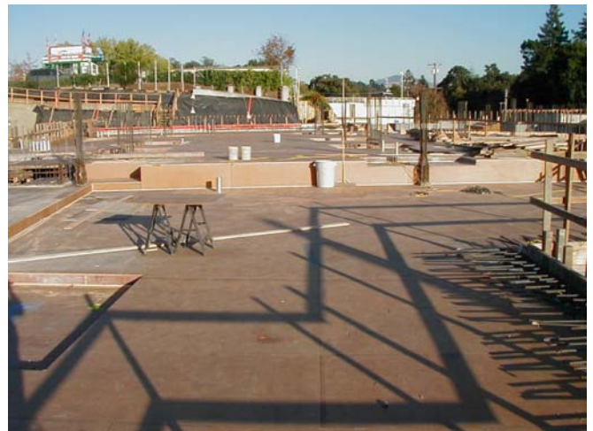
First Floor deck layout

The attached Project update to the Redevelopment Agency Board is attached with additional information.