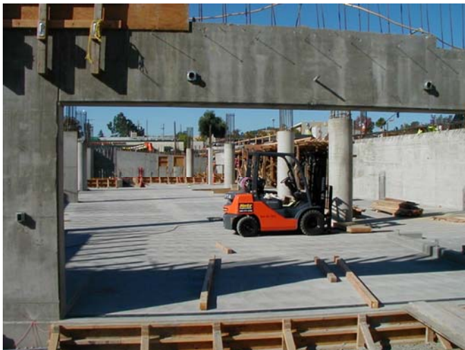
Looking west from the parking lot into the finished Basement parking garage floor