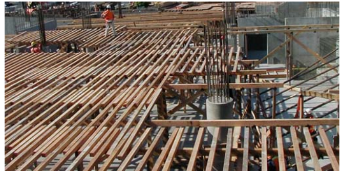
First Floor deck shoring