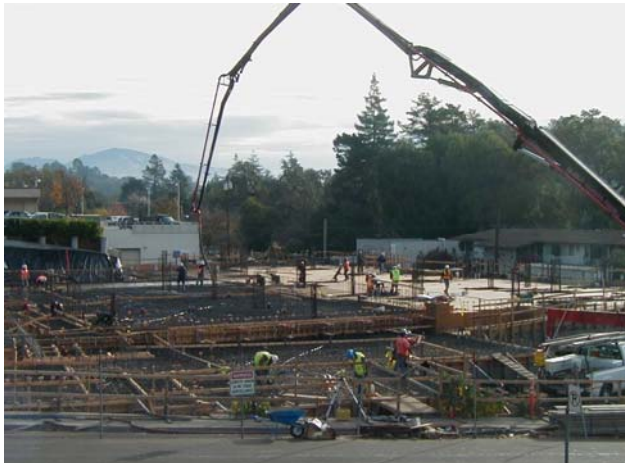
Looking east at the concrete pour for the First Level parking floor