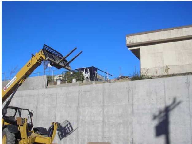
Looking north at the completed Parking Lot retaining wall below Boswells

The project is in the 36 th week of construction. Activity has moved to the First Level with the installation of the deck, cabling, and rebar, and pouring of the parking floor.