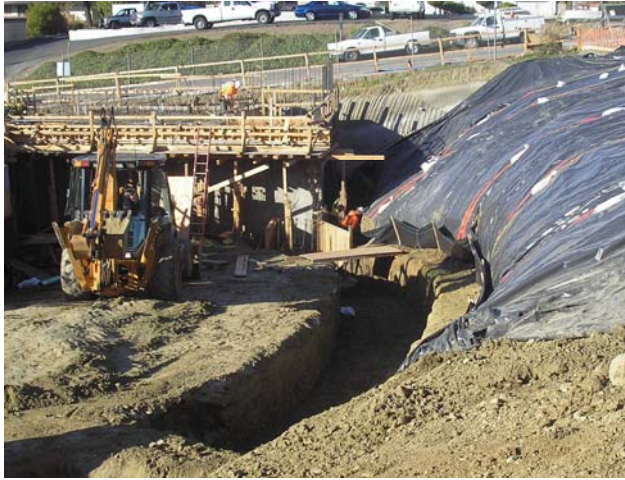
Looking west at the excavation for the ramp between the Basement and First Level parking floors