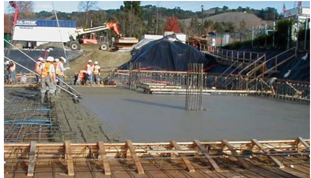
Looking north at finishing the concrete pour for the First Level parking floor