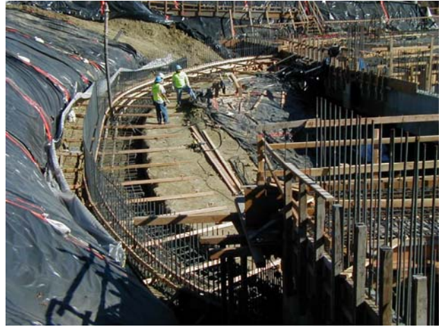
Looking east at the rebar installation for the ramp between the Basement and First Level parking floors