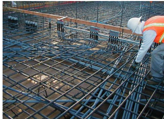
Installing rebar over cable conduit in the floor of the Telecommunications Room on the First Level