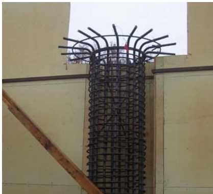
Column form on First Level