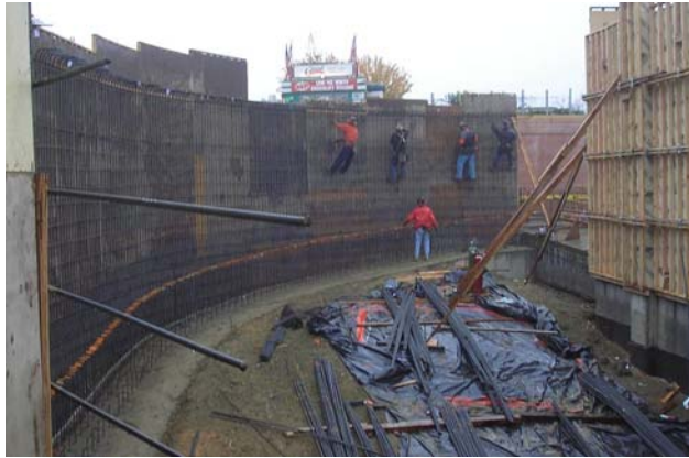
Looking east at the parking ramp wall

The project is in the 38 th week of construction. Activities included the forming and pouring of the ramp between the Basement and First Level parking, pouring of the First Level deck, and beginning the rebar work on the First Level walls.