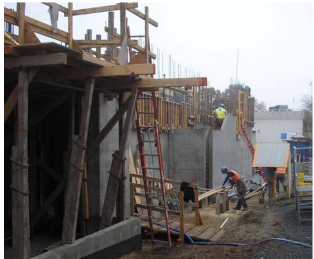
Front of Lafayette Historical Society's space (in the foreground)