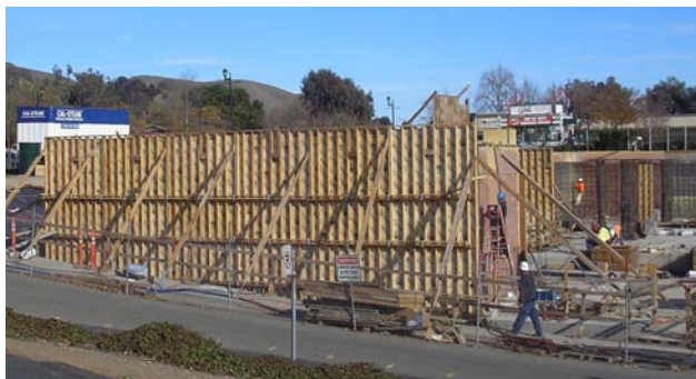
Looking east at the wall form for the Bicycle Room and Emergency Generator Room on the First Level