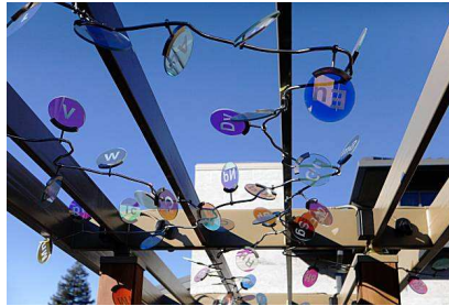
Children's Activity Deck

Outside, a sculpture of pages being blown by the wind will guide visitors from the outdoor amphitheater below to the plaza above. Inside, library patrons can read next to a Zen garden or under a "solar fireplace."